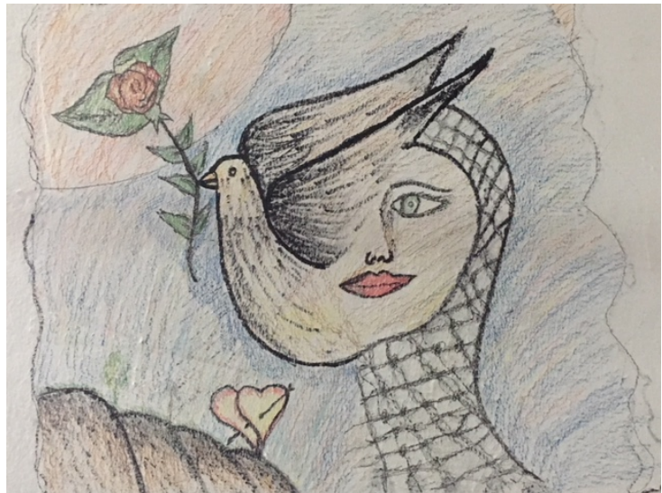
Picture drawn on a bare wall of a Gazan home