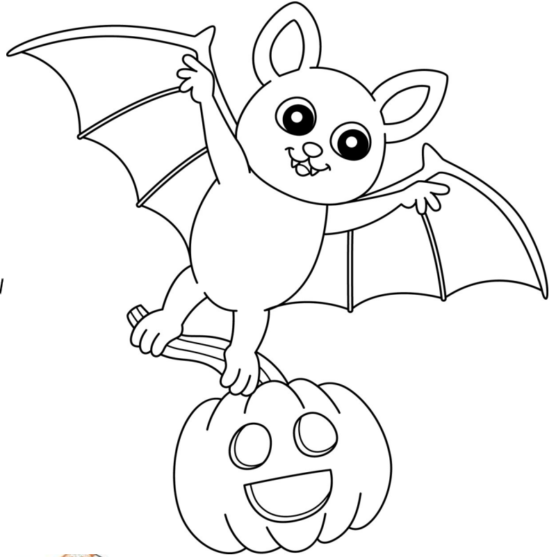
Colour the Picture